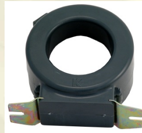
SOLID CORE CURRENT TRANSFORMERS