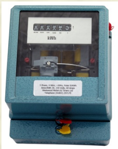
DISC DRIVEN THREE PHASE METERS