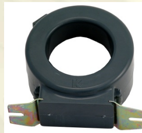
SOLID CORE CURRENT TRANSFORMERS